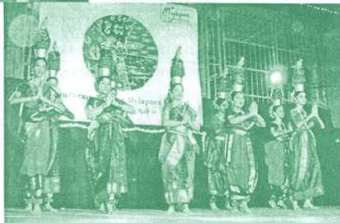
Karagattam performed by the members of the Heritage Club, during the Mylapore Festival